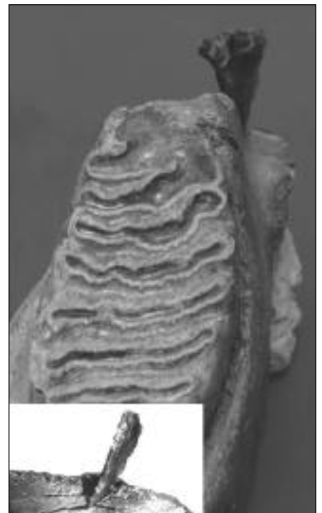
Mandible (jawbone) from a mammoth skeleton discovered by Armenta near the small hamlet of Arenillas, north shore, Valsequillo Reservoir. Protruding from the bone is a flint spearpoint. Inset: Another view of the spearpoint in place, showing the damage it caused to the bone.

A quarter-million years? That meant that if we were ever going to date the site using other than the controversial uranium-series method, we would have to stop thinking "New World" with its comfortable 14 C dates and start thinking "Africa". Only in Africa, with the early hominid research going on there, would we find the means to date such old archaeological material.